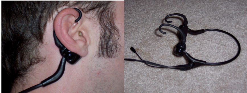
Fig. 2. Bonephones support auditory display and simultaneous processing of ambient cues

if small) are also unacceptable for reasons of privacy and user-acceptance. For this reason we have had to consider display alternatives such as bone conduction headsets that can provide private audio for the primary task while not impacting too much the secondary task. Certainly, with the use of bone conduction, the nature of the audio output needs to be reconsidered for audibility, quality, etc. [11-13].